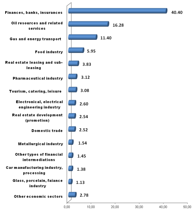
The weight, at market value, of the activity sectors in total portfolio - % -